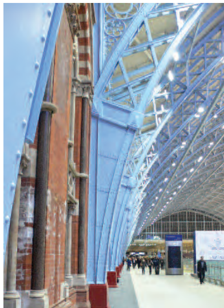
Figure 12 Of the £800 million restoration programme for the new Eurostar Terminal at St Pancras Station, only a very small proportion was spent on the scientific analysis to research previous paint schemes.