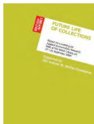
Figure 22 Cover image of the Future Life of Collections, a summary of a meeting funded by the Andrew W Mellon Foundation to discuss the development of a strategy for applied conservation research into paper-based library and archive materials.

Initiatives such as Future Life of Collections which identified and prioritised research for the libraries and archives sector are important developments, and have yielded useful results that have tackled some of the most critical issues. Similar programmes are needed for other sub-sectors. AHRC / EPSRC research clusters (such as EGOR) have provided settings in which to direct research agenda in the absence of more formulated structures.