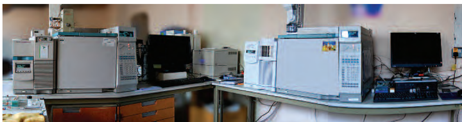
Figure 11 Some of the equipment used for organic analysis in the Department of Conservation and Scientific Research at the British Museum. Shown here are two GC-MS instruments (the instrument on the left is fitted with a pyrolyser). Other equipment includes HPLC (high-performance liquid chromatography) for dyes analysis and a FTIR (Fourier Transform Infrared) microscope for characterisation of a range of organic and inorganic materials.