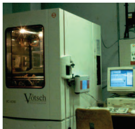
Figure 17 Modelling the corrosion of iron infested with chloride salts within a climatic chamber at Cardiff University. This study to improve the understanding of the behaviour of heritage materials underpinned the conservation plan for the ss Great Britain.

The other area where additional research is suggested is in relation to NHSS theme 4 where recommendations are given for the need to enhance existing techniques and develop new tools and techniques.