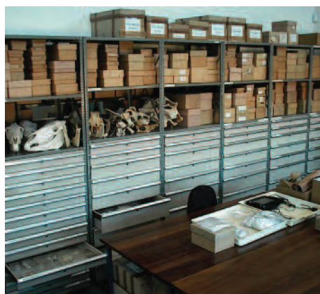
Figure 21 The English Heritage vertebrate skeleton reference collection at Fort Cumberland.