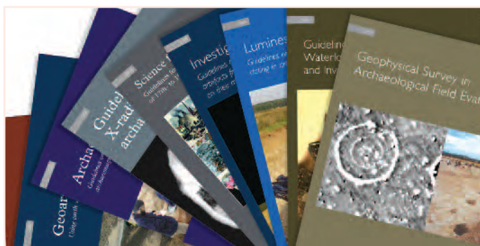
Figure 18 A number of recently produced English Heritage scientific guidance documents.