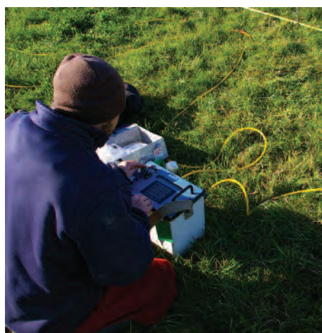
Figure 13 Chris Carey employing the IRIS Syscal Electrical Resistivity Ground Imaging (ERGI) system to investigate subsurface stratigraphy at Lockington, Leicestershire, as part of the English Heritage ALSF-funded Trent-Soar project (PNUM 3357).